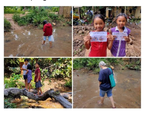
A little bit of extra water does not prevent anything in the Philippines!

We continue to take food into other areas and give out a bible story and colouring for every child. We also continue to give out activity learning sheets for the children who are not currently registered at schools.