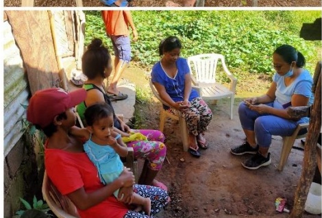
Adult small groups in Digiboy 2 & Kinsedias

We continue to take food into other areas and give out a bible story and colouring for every child. We also continue to give out activity learning sheets for the children who are not currently registered at schools.