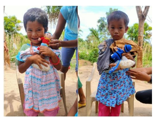
The Children were proudly wearing their new clothes the following week.

We were also able to bless them with food parcels and some of the clothes we had left from the donations we received from family and friends in the UK. Thank you again to all that made this possible.