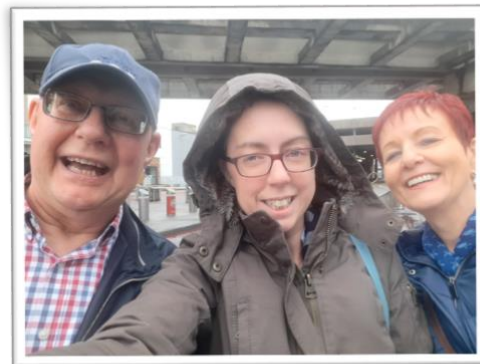
One advantage: getting extra time with family