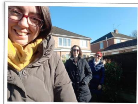
Even if, socially distanced... still not been able to hug my sister or my nephews!