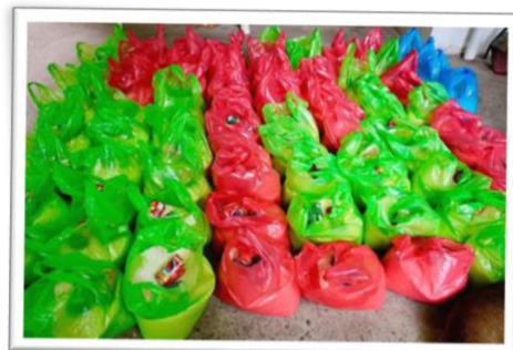
Food packs for 200 families