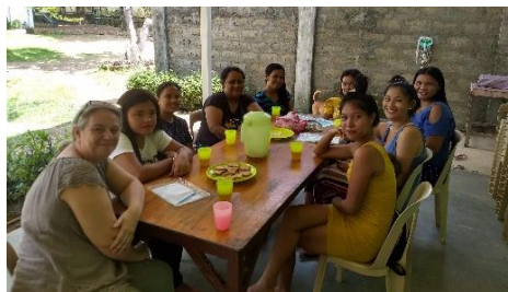
Weekly Bible Study