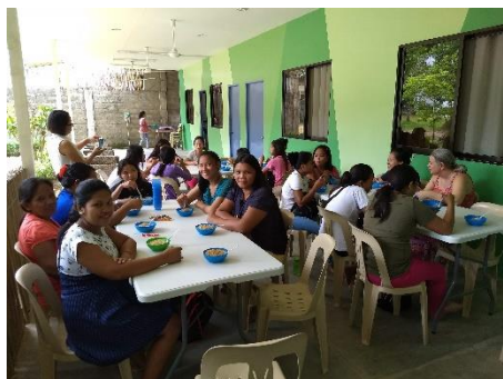
Food following the alpha session

The parents also attend an Alpha course on Fridays, and we have opportunity to join and assist in this. The plan will be to provide more discipleship sessions after the Alpha course is completed.