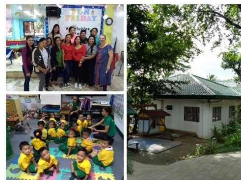
The teachers, the school and students.

A typical day starts with devotions at 7.30am for staff and teachers. These are really wonderful times where someone will share God's word and thoughts for that day, this is then followed by a time of physical exercise. This is great fun and has involved games, Zumba and dancing. It's great to start the day with a spiritual and physical 'workout'.