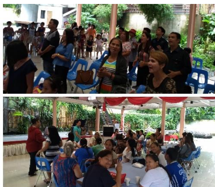
Sunday service & Alpha