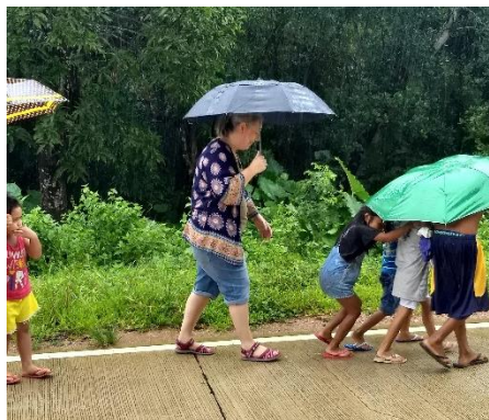
On the way to kid's club on a very wet day!

City Gates Church has a heart to reach out to people in the local communities. There are very poor communities in the area including families with children who live and work on a local rubbish dump site. They have a kids' club and feeding programme established here and 3 other local areas on Saturday mornings where the children and youth can have fun and games plus hear a gospel message.