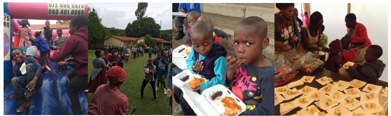
Saturday 19<sup>th</sup> November – After a huge amount of planning and preparation we hosted the Elim Global Christmas Party for the children of the villages of Graskop, Moromela, Leroro, Matibidi and Pilgrims Rest. We had 183 children attending from these five villages that surround Graskop. The

We are thankful for these Christmas parties held for children all over the world, hosted by Elim UK.