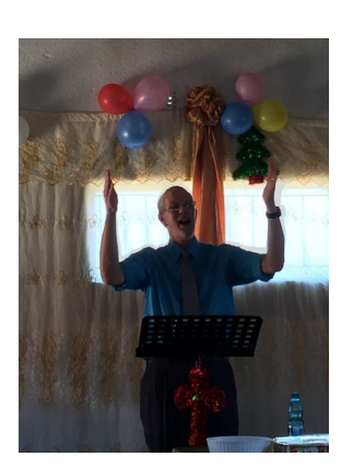
Grade R graduation